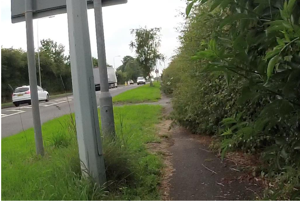
HEDGEROW AND GRASS VERGE ENCROACHMENT ON BYE PASS ROAD

Regional Cycle Network Route 71 to Packhorse bridges at Hockenhull Platts