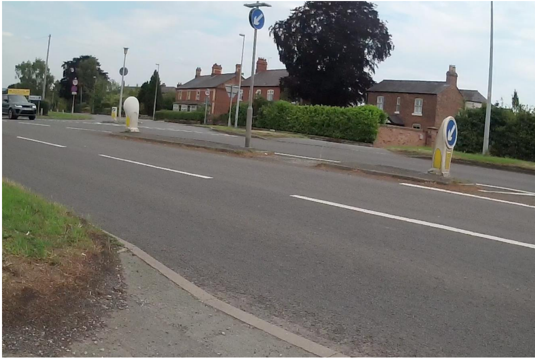
ACCESS POINT 1

pavement on the opposite side to the SUP could also be made a SUP. The pavement also passes the entrance to the recreation ground King George V Playing Fields which has good provision for cycle parking.