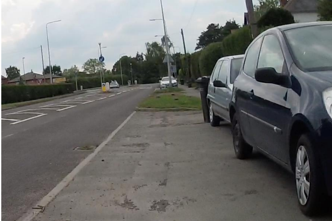
OBSTRUCTION ON BYE PASS ROAD

pavement closest to the carriageway. Ideally, at low cost, SUP line markings could be put down on the pavement to achieve this along with more SUP signage. At the Tarvin Sands end of Bye Pass Road hedgerows and verges need trimming back.