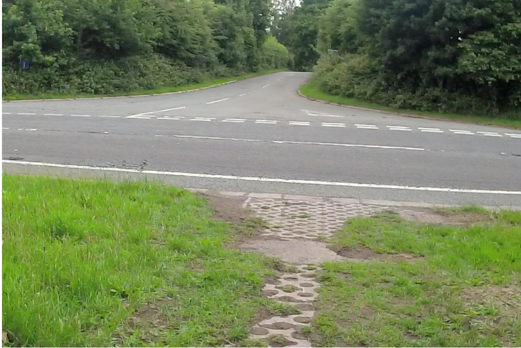
ACCESS POINT RCN 71