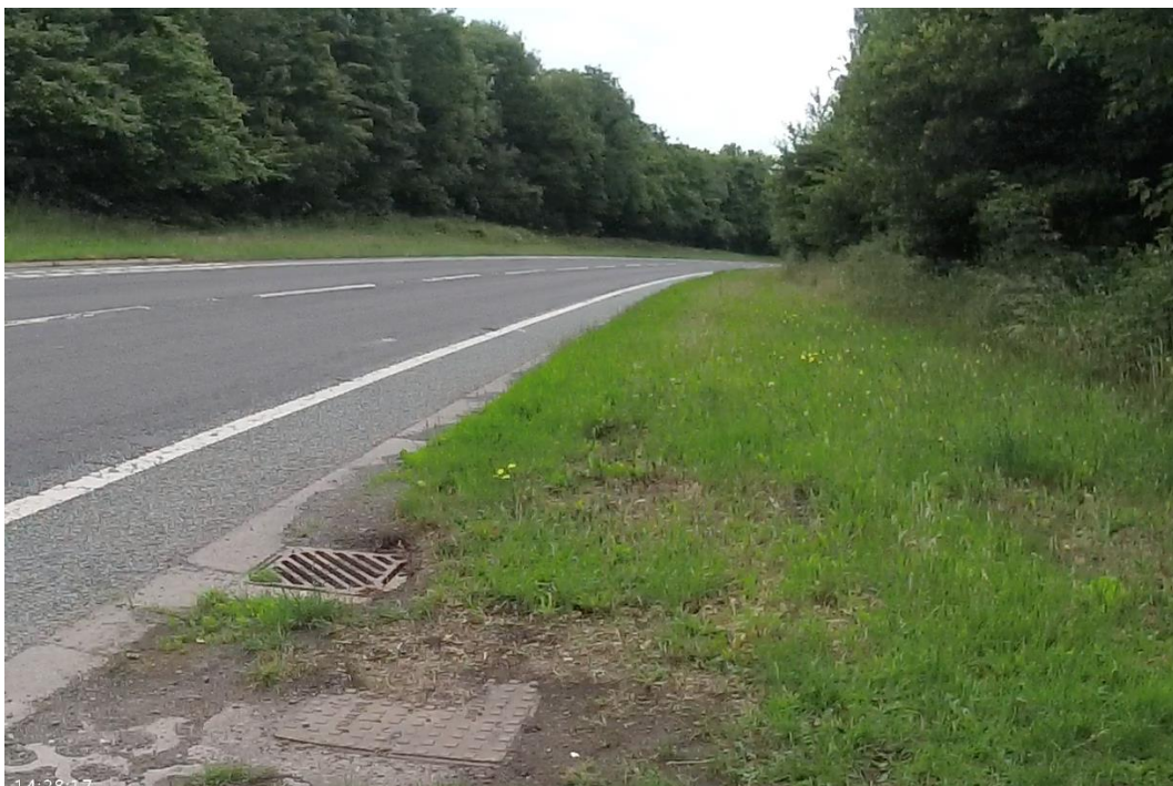
OBSTRUCTED VIEW ON BEND IN A51 AS SEEN FROM CROSSING POINT

To access the countryside by public footpath and Regional Cycle Network Route 71 it is necessary to cross the busy A51 at Hockenhull Lane, Tarvin. Traffic is accelerating away from Tarvin roundabout on a sweeping bend in the direction of Tarporley, Nantwich and