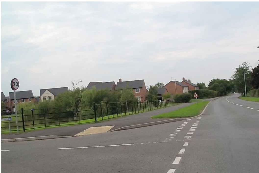
CYCLING INFRASTRUCTURE ON TARPORLEY ROAD STILL NOT SIGNED AS SUP

When the Taylor Wimpey development was built a SUP was installed from the junction of Sanford Drive and Tarporley Road but no SUP signage has ever been installed so very few people know that it is there to be used as a SUP to access the new development. This is a 40 mph stretch of road so safety of cyclists is key.