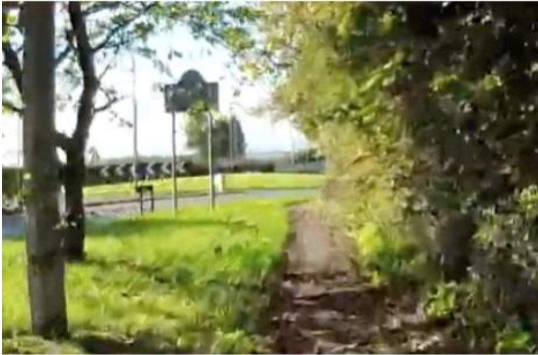
SUP APPROACH TO TARVIN ROUNDABOUT