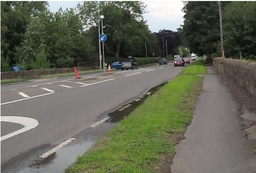
LOOKING TOWARDS ACCESS POINT 3

could be made into a SUP at little cost. This would mean that cycling between Oscroft and